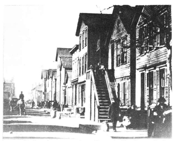
A Maxwell Street scene such as those in the Rogers Park Library Exhibit