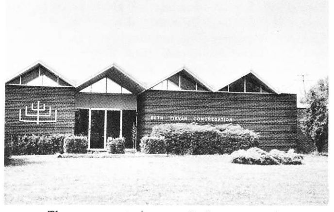
The current home of Congregation Beth Tikvah in Hoffman Estates.

When the Conservative movement was not interested in helping the congrega-