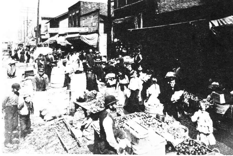
The more familiar: Maxwell Street market in the early years of the century.