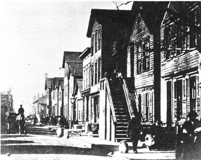
The less familiar: Maxwell Street as a residential area for Eastern European Jews.

There are two concurrent exhibits. One centers on early views of Maxwell Street and covers the market area from the 1880's to the 1920's, the major years of heavy Jewish involvement. It includes photographs, posters and publications and was assembled by Alan Teller, a historical photographer who was one of the speakers at our June meeting.