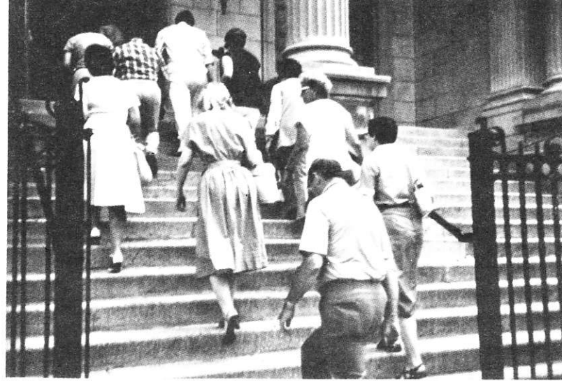
Summer Tour visits the old Ohave Sholom (Mariampoler) congregation building on the near West Side.