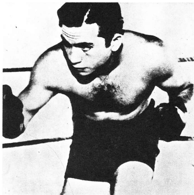
Barney Ross: Success Story and Tragedy

In the 1930s there were eight Jewish champions, second in number only to the Italians, and the decade was the heyday of Jewish pugilists in Chicago. There were