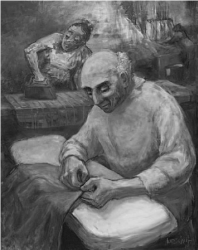
Painting of a tailor's shop

school, subsequently shut down during the McCarthy Era of the 1950s, had been founded by civil rights leader William L. Patterson, an African-American attorney who helped to organize the defense of the Scottsboro Nine, the black teenagers who had been falsely accused of raping two white women in Alabama in the early 1930s.