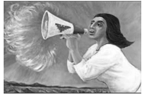
Painting of labor leader Dolores Huerta, co-founder of the United Farm Workers