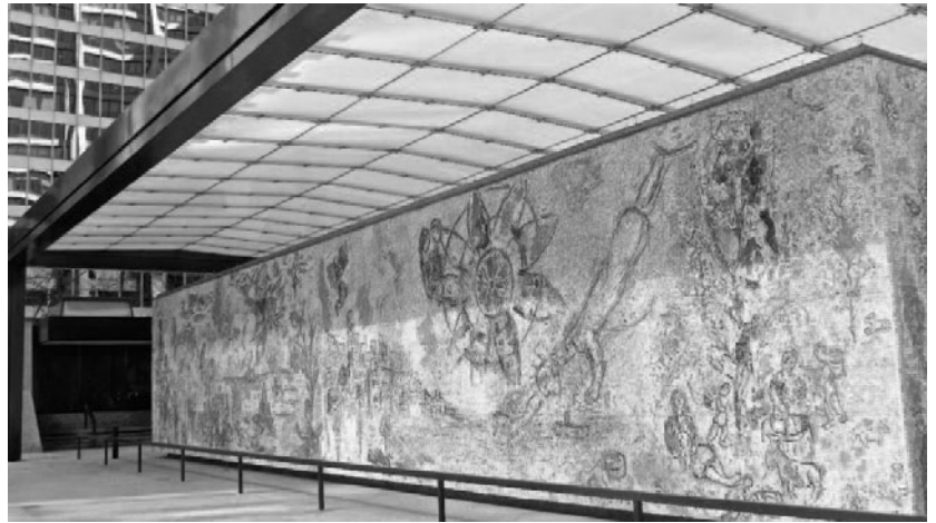
The Chagall mosaic at Chicago's Chase Tower

During the months of the mosaic's construction, excitement and anticipation continued to build. Chicago's Museum of Contemporary Art and Chas. A. Stevens, a then-prominent women's department store, offered Chagall-themed jewelry for sale.