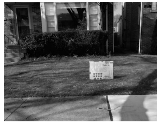
Jewish neighbors in Chicago's West Rogers Park found a safe way to observe Passover together during the shelter-in-place policy, posting individual verses from a popular festival song.

It is unclear, as of this writing, when life as we once knew it will return to normal. Many now speak of "the new normal," but are vague about what that will look like. Will people sit down together in theaters, restaurants, trains, buses, and other public venues? Will they go to Wrigley Field and Soldier Field?