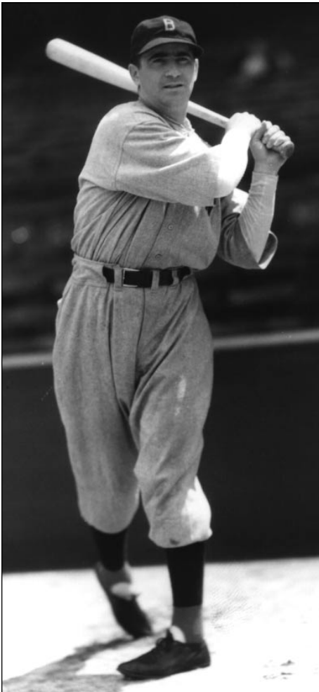
Moe Berg as a Boston Brave in the middle 1930's

As the 1999 major league baseball season begins, and Chicago fans prepare for our annual disappointment, we offer these humorous, history-filled lyrics as a comforting diversion for our readers. ♦