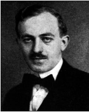
Ben Hecht in 1924

photograph from the book History of the Jews of Chicago; published by the Jewish Historical Society of Illinois, 1924