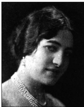
Rosa Raisa in 1924

The opera being performed that night offered a particularly apt memorial to Chicago opera's great Jewish soprano. Verdi's Nabucco (Nebuchadnezzar) is about the