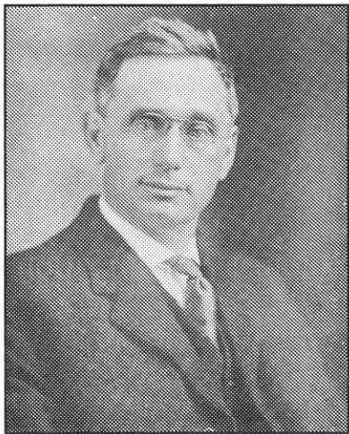
Justice Louis Brandeis

to implement Jewish immigration to Palestine. He concluded: "It remains for the Zionist Organization of America to combine the practical with the ideal. Just as the British Government will assume the mandate to convert Palestine into the Jewish homeland, so our Zionist