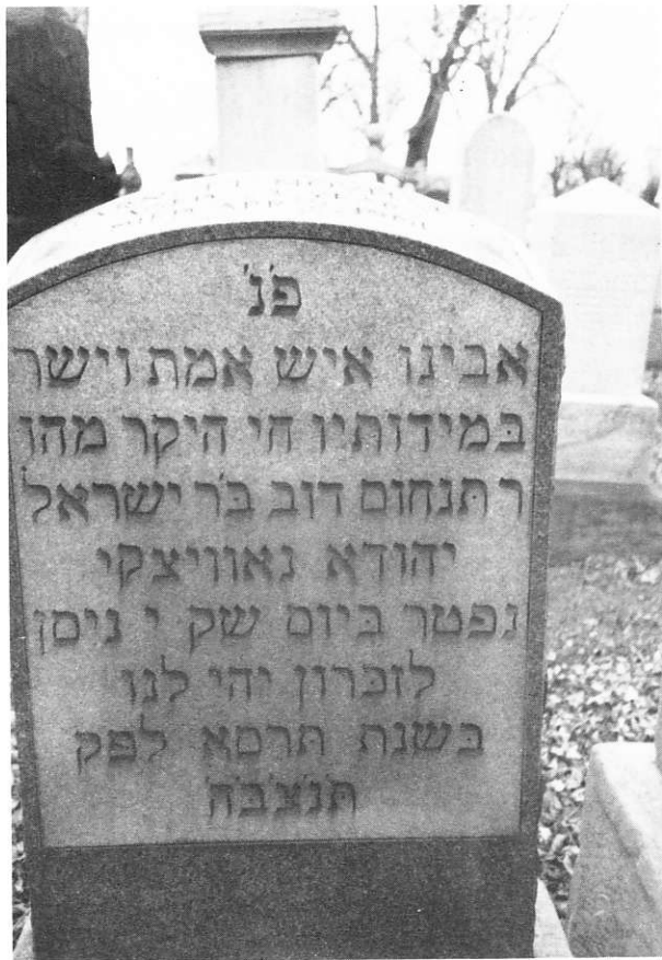
Tombstone of Barnett Novitsky