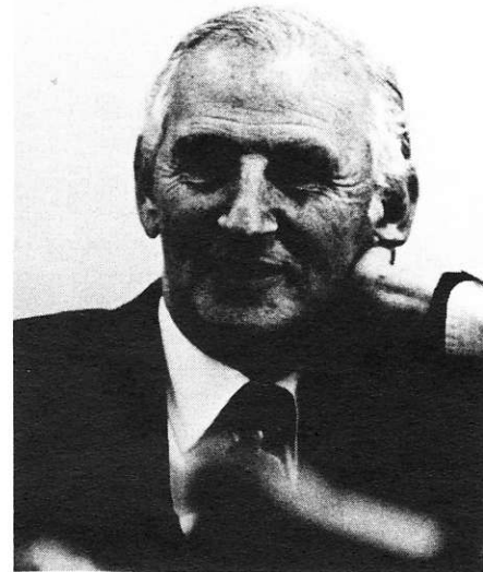
Sidney Yates: an amazing, even impeccable congressman

A recent statement by Yates gives his fundamental views: "I still think people will support the Democratic Party because it stands for the New Deal programs and the other social programs that the party gave. The programs we created were supposed to provide a means for people to move forward. Do you go back to creating slums? Do you go back to miserable conditions? Do you do away with education the way Reagan wants to? Do you do away with health research after all the benefits we've seen emerge to make us the healthy people we are? Do you do away with cancer research? Do you do away with public transportation? The fact remains that people in the city still need housing; the problem is that there is so little private housing built for people in the lower economic level. So you look for solutions. The