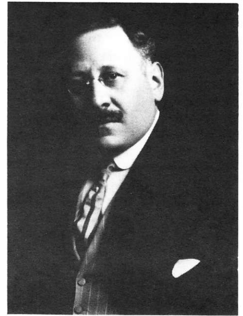
Julius Rosenwald: noble and fine...but unwise

Well, Smith declined Rosenwald's offer and was elected. The Senate, however, refused to seat him. The disgrace was thus somewhat mitigated. It was imprudent of Rosenwald to make such an offer. It was unwise to offer a candidate 10,000 shares of stock to withdraw in favor of another candidate. Yet it was a very noble act, and I have chosen it as an illustration of the period from 1920 to about 1932 because it exemplifies Republican predominance and also gives us an example of a public-spirited Jewish Republican actuated by the highest ide-