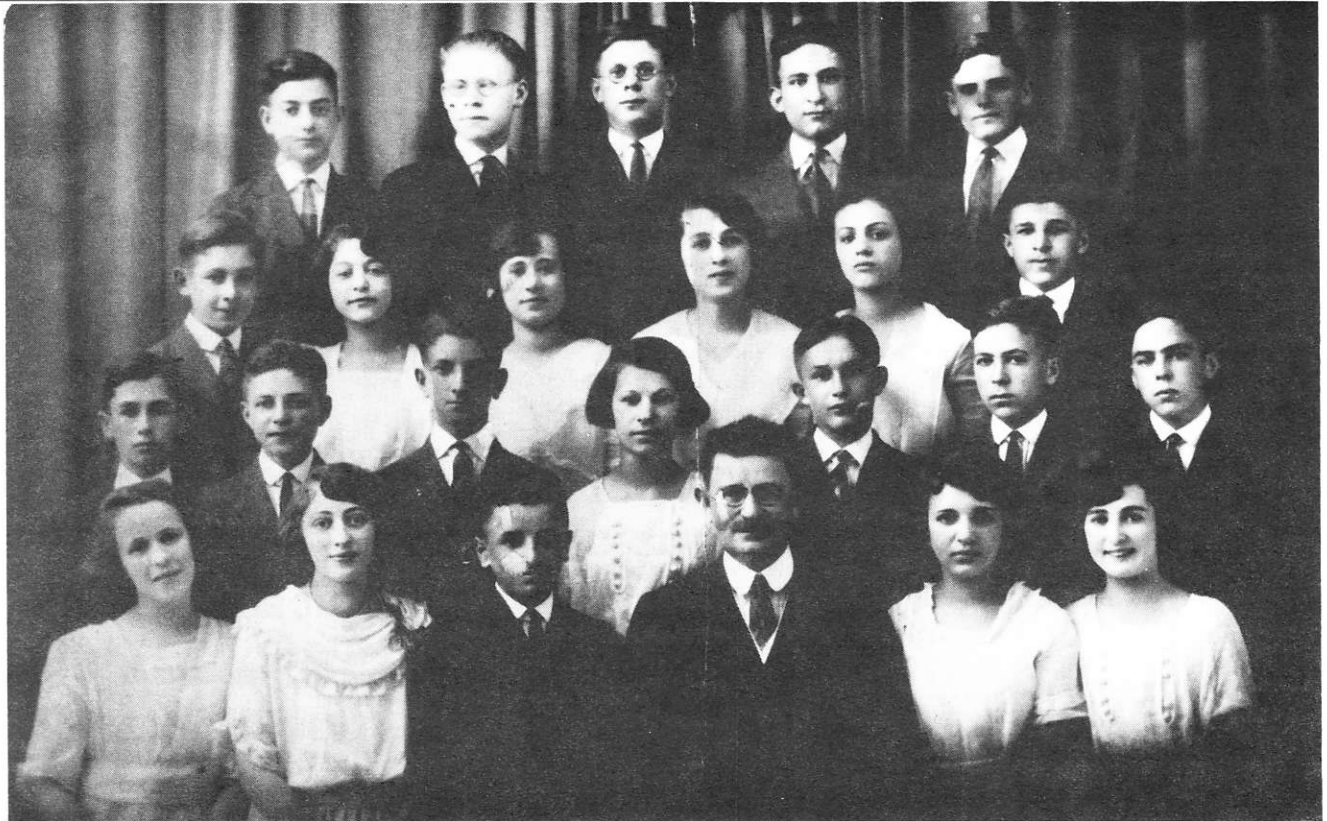
"Graduates" of the Chicago Home for Jewish Orphans about 1921. Can you identify any of these young persons and/or tell us about their present whereabouts? See story for details.