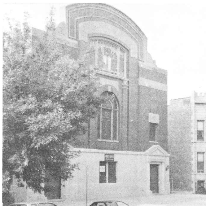
The former Temple Emanuel building, now slated for demolition.

Contributions for the Chicago Jewish Archives at Spertus College are always welcome. Contact Norman Schwartz at 944-4444 or Elsie Orlinsky at 643-9666.