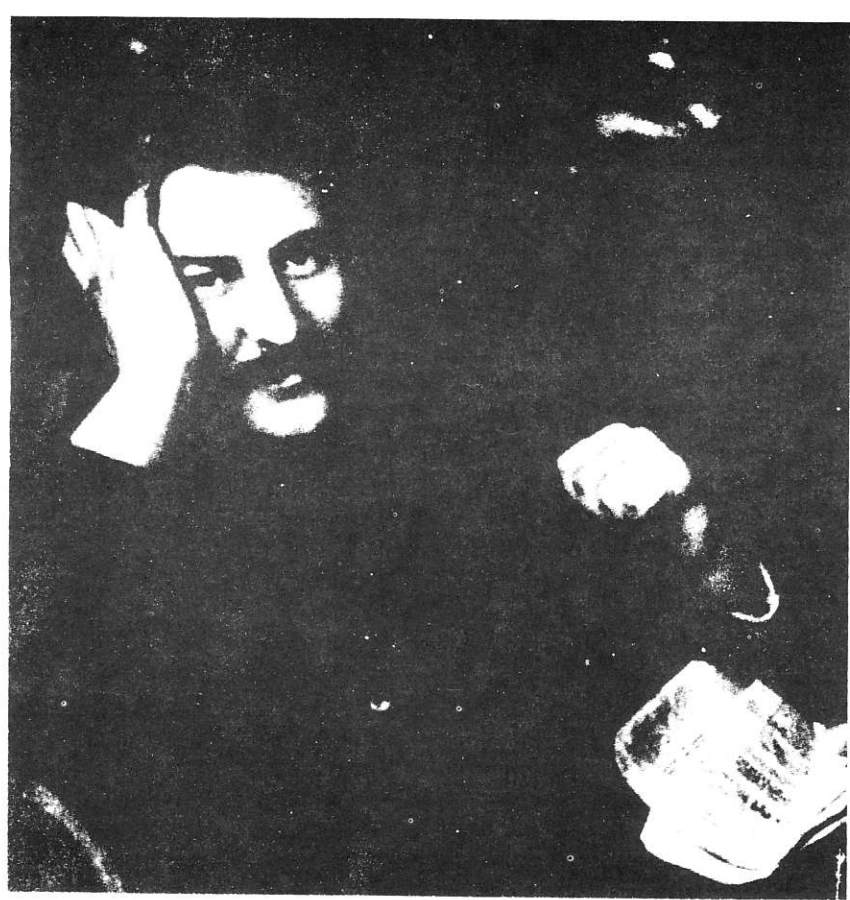
Ben Reitman ca. 1912