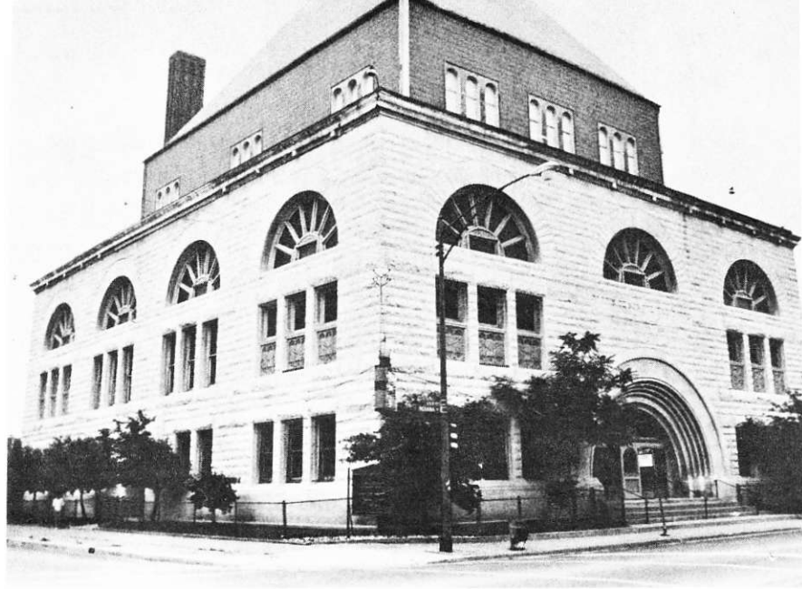
The former home of KAM Temple at 33rd Street and Indiana Avenue, built by Dankmar Adler (left, as a young man) and his partner Louis Sullivan in 1890. It is now the Pilgrim Baptist Church.