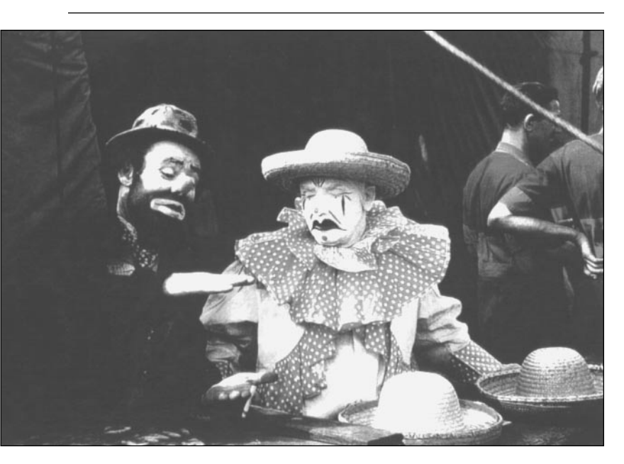
Elizabeth Stein: Two Clowns © Elizabeth Stein