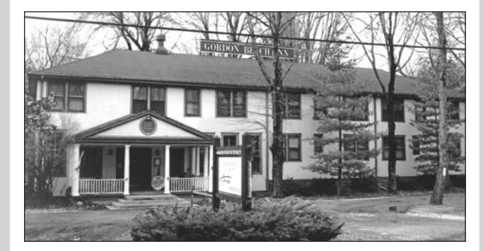
Gordon Beach Inn, Union Pier, Michigan. Article begins on page 10.