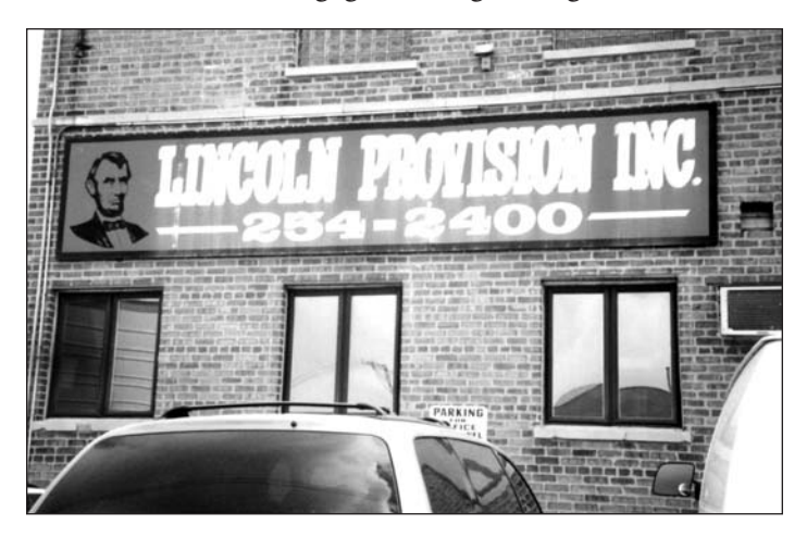
Lincoln Provision Inc., 824 West 38th Place, Chicago.